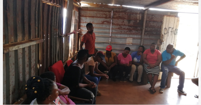
Above: Young people in Kameeldrift have come together to form a forum that will be innovative to use assets within their community to tackle unemployment, economic development and many other issues.