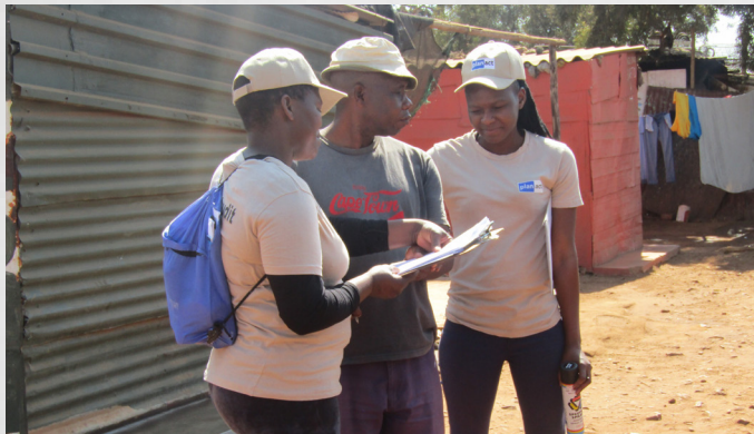
Above: Kameeldrift community volunteers interview a resident in Pretoria during a social audit on chemical toilets.