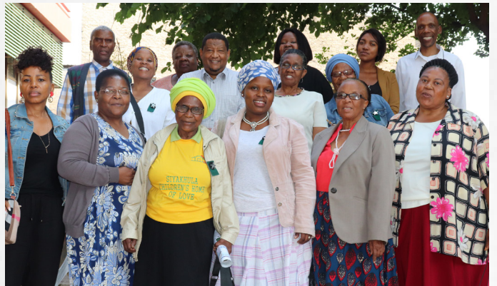
Above: Siyakhula Trust committee members supported by the Planact team after their first capacity building exercise conducted by Planact to establish the children's home.