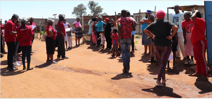
Above: One public meeting where residents get to choose their own street names during a public street naming process for the whole of the Skoonplaas informal settlement, in Springs, City of Ekurhuleni.