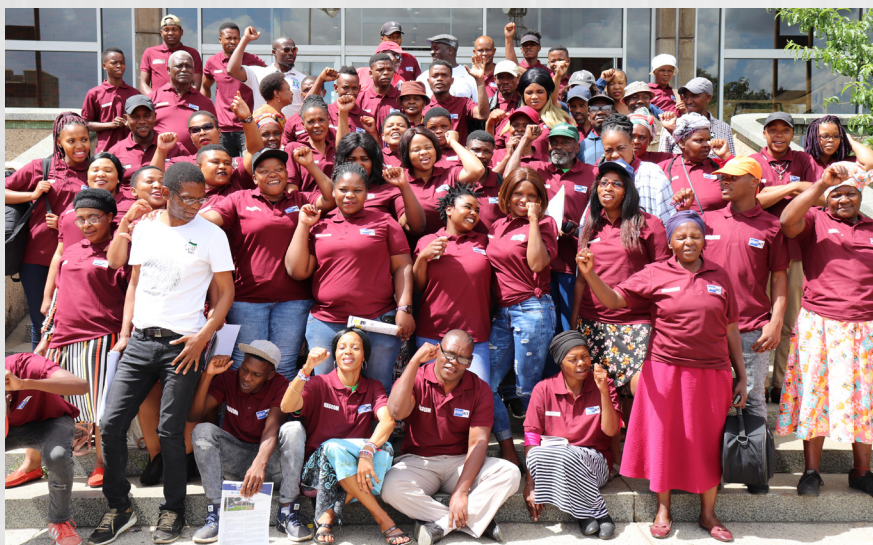
Left: Community representatives from Emalahleni informal settlements after the cluster launch put up their fists to show their power as a united force.