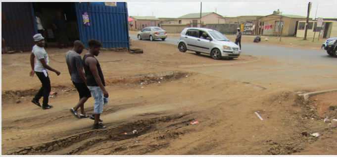
Above: This was the state of some major roads in Tsakane before the community was promised tarred roads in 2004.