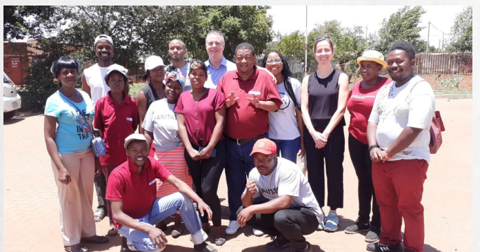
Planact, Illuminate, Social Audit Network staff members after a project site visit in Thembelihle.