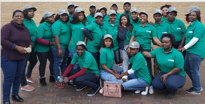
Above: A team of community volunteers from Lawley Station informal settlement after a debriefing session, at Planact offices, on their findings after the sanitation needs assessment.